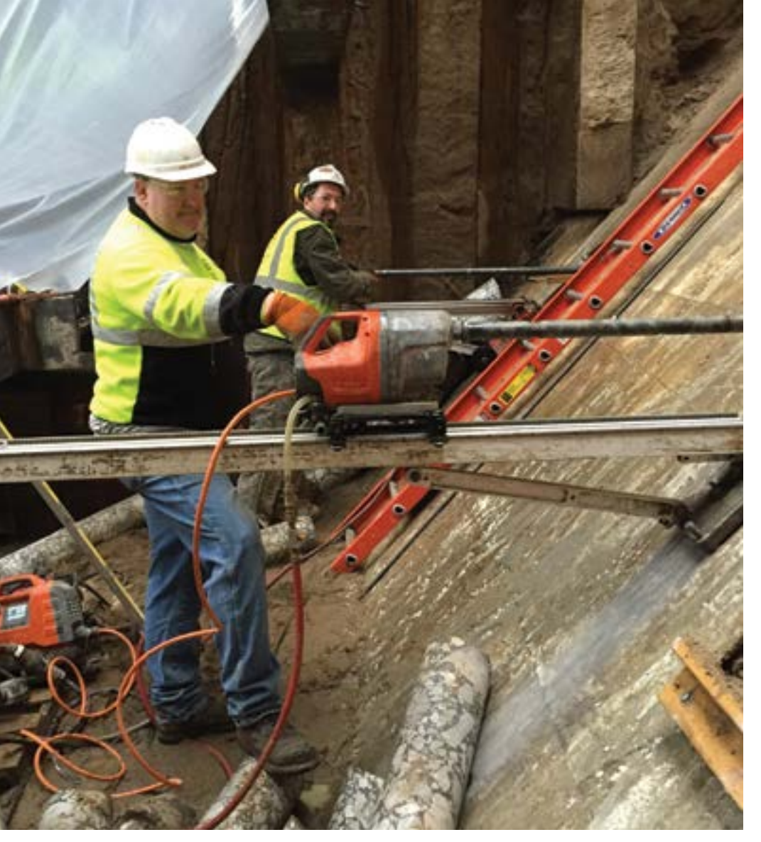
Above: Operators core drilling 8-inch-diameter holes into the face of the dam. Below: 15-milimeter wire was pushed into the holes and then smaller diameter wire was used to make the vertical back cuts.

Most of drilling for the wire holes is being done with Husqvarna hi-cycle drills while the wire sawing is being done with a pair of Diamond Products WS 50 hi-cycle wire saws.