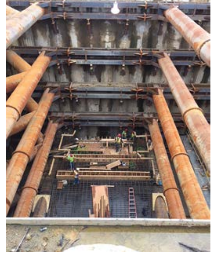
This photo shows the secant piles and temporary steel holding back the lake.

Included in this job are six openings measuring 28 feet wide by 40-80 feet-tall through 5-foot-diameter secant wall and four initial cavities cut into the downstream and upstream faces of the dam, each 28 feet square by 8 feet deep. A pair of 25-foot octagonal passageways through the center core of the dam, each 25 feet deep, make up the final phase of the project. The diagram of the project shows the three main pieces of the drilling and sawing work through the dam. Step 1 (diagram) shows the downstream cavity work in the dam core. Step 2 (diagram) shows the final cuts in the dam core including the octagonal passageways.